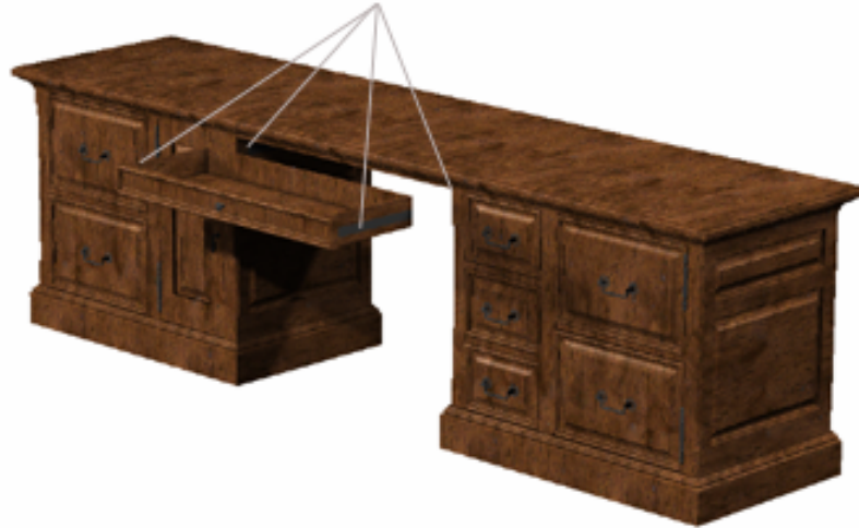
DRAWER METAL SLIDES

Lastly, insert the keyboard drop-down assembly into the drawer metals slides provided.